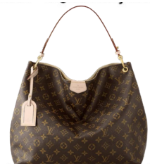
Louis Vuitton Graceful MM Retail Value $1890 Winner does NOT need to be present Tickets 1 for $10; 3 for $25

Thank you for your ongoing support and we hope to see you at Pocketbook Bingo on Friday, March 3!